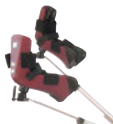
Full Line Table Accessories