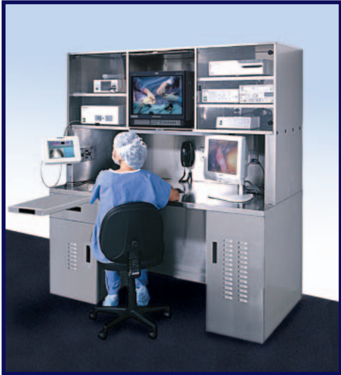
72" Wide Nurse Document & Communication Center (SSNDC-72-L)