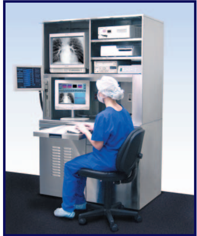
48" Wide Nurse Document & Communication Center (SSNDC-48)